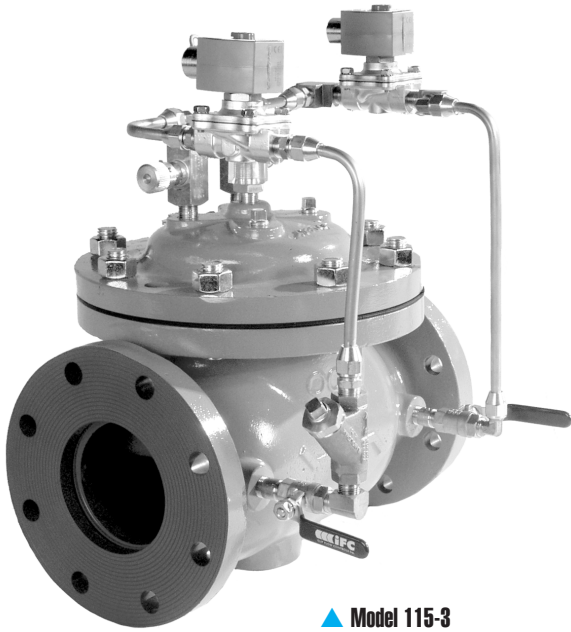
▲ Model 115-3

The Model 115-3 has a wide range of applications: anywhere it may be required to position a valve electrically.